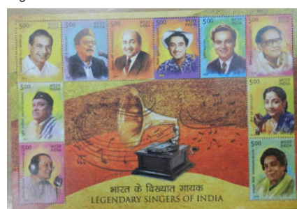
Stamps recalled: Legendary Singers of India